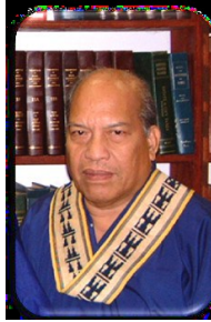
FSM Supreme Court Acting Chief Justice Honorable Ready E. Johnny

First, I want to extend our collective gratitude to Government of New Zealand, specifically the Ministry of Foreign Affairs and Trade, and Government of Australia, specifically the Federal Court of Australia, for their continuing support and services to the FSM judiciaries through PJDP.